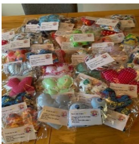
Hearts made by our volunteer sewing team