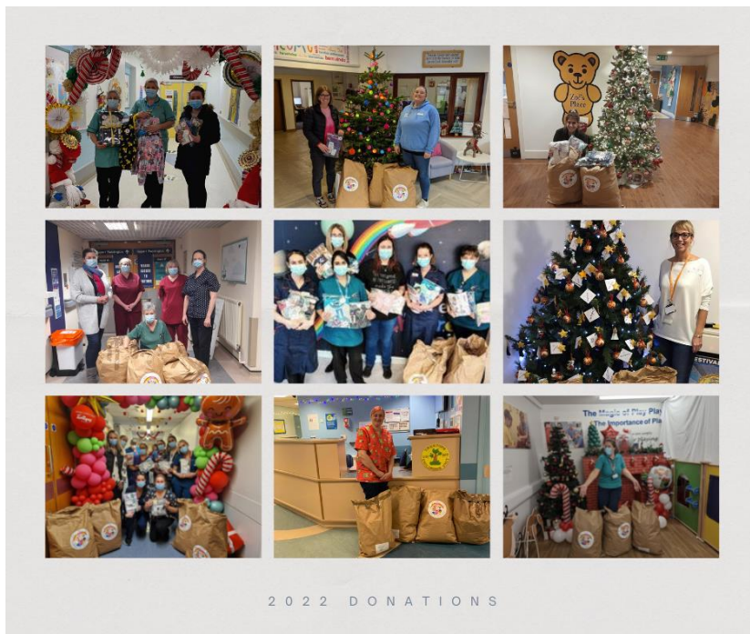
Some of our deliveries