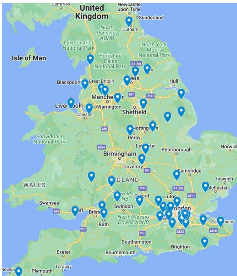
Locations of 2022 coordinators