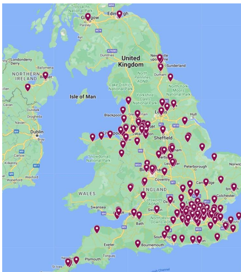
Locations of 2022 donations