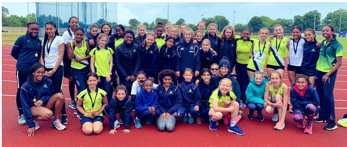
Croydon High are GDST ATHLETICS CHAMPIONS in both the senior and junior competitions!