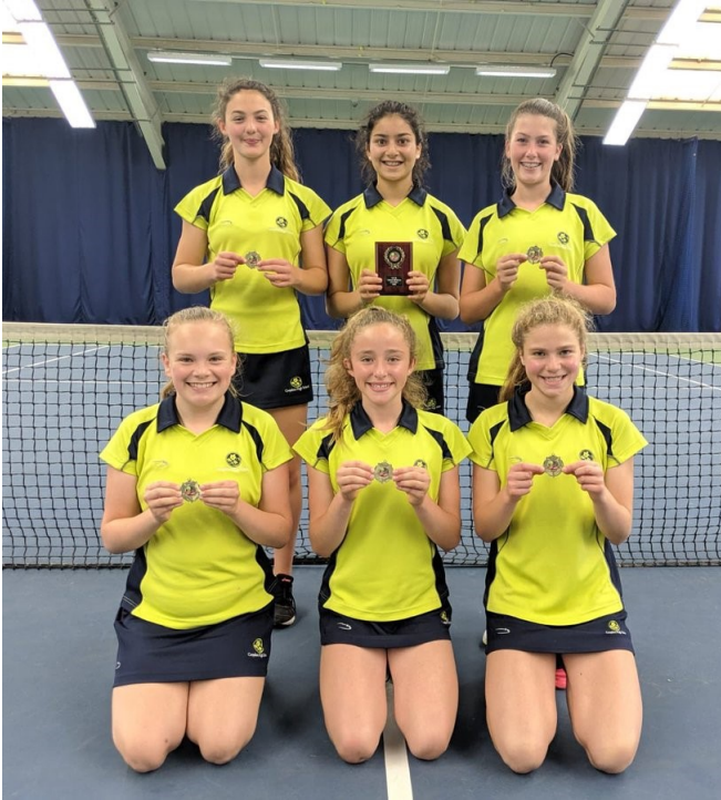
Congratulations to Croydon High Under 13 Tennis Team who are Surrey Schools' League Champions!